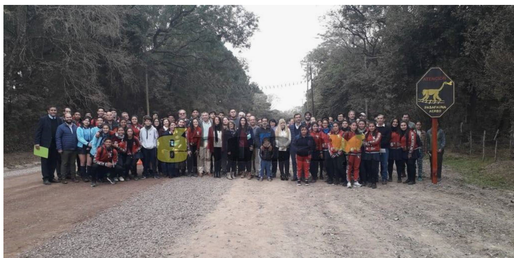
Figure 5. Students and teachers from San Cayetano and Pio XI high schools, with the mayor of the Municipality of Riachuelo and co-authors MK and MR on canopy bridge inauguration day in Riachuelo.

concerning the threats to A. caraya and the native forest. Several stakeholders were included in the process, which resulted in broader community buy-in (Lokschin et al. , 2007; Teixeira et al. , 2013). Urbanization of A.