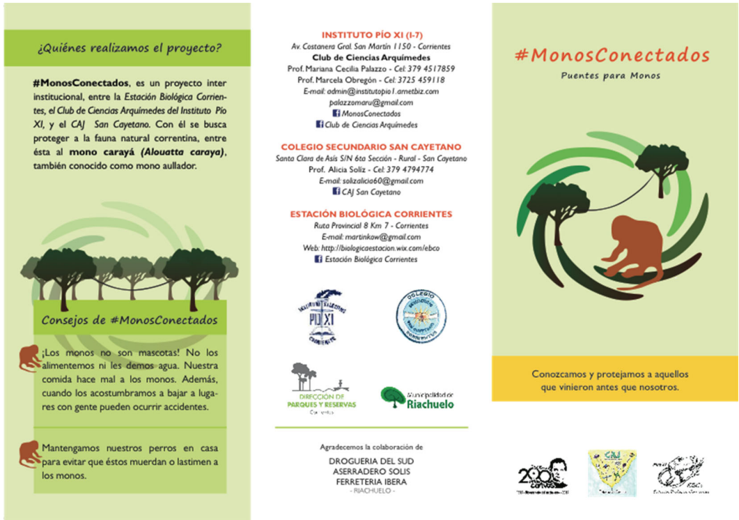
Figure 3. Brochures (in Spanish) for the #connectedmonkeys (#monosconectados) project.

people or natural conditions. Although members of the community are interested and doing ad libitum observations, we still do not have confirmed the use of the bridge by howler monkeys or other animals.