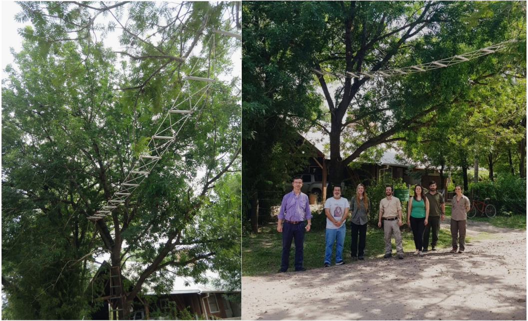
Figure 6. Canopy bridge installed by the researchers in San Cayetano Provincial Park (PPSC) and close to the San Cayetano Primary School, with authorities of the Municipality of Riachuelo, park rangers, and the team from Estación Biologica Corrientes (EBCo).

between humans and wildlife (Kawata, 2014; Pooley et al. , 2020).