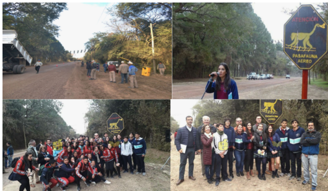
Figure 4. Images of the canopy bridge inauguration day, with the municipality staff, park rangers, teachers, and students from both high schools, and the team from Estación Biológica Corrientes (EBCo).