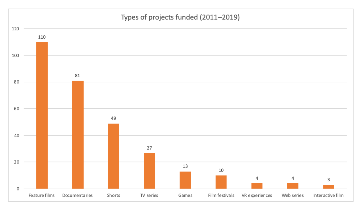
Figure 2: Distribution of types of projects supported by Den Vestdanske Filmpulje, 2011–2019.

and AR experiences, film festivals and of course feature films. Figure 2 below shows the spread of projects supported by DVF funding.