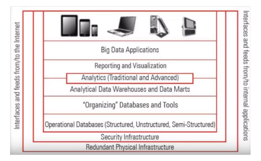
Figure 2. Big data technology stack

technology stack consists of eight architectural layers, as shown in Figure 2 [66]. Organizations will use different stack elements depending on the problem it is addressing.