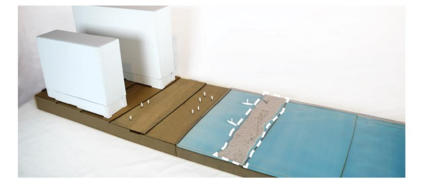
Fig. 1 Strategy proposal: Coral

strategies discussed include T-head groins, underground cisterns, multi-use berms, or elevated walkways. The research products include visualization of living shoreline and green infrastructure in drawings and interactive physical models used in an international workshop and university classrooms. In addition, training benefits include architecture and planning students who learned about coastal flooding and proposed design scenarios through coursework and research for this project.