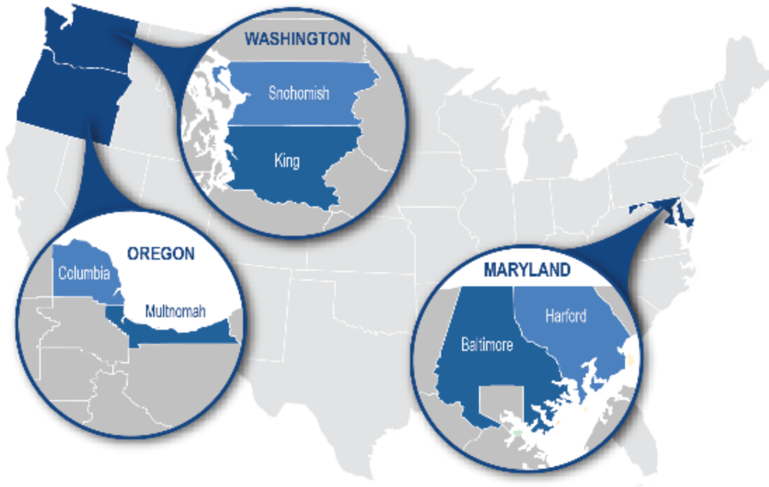
Figure 1 Map. Washington, Oregon, and Maryland Counties.