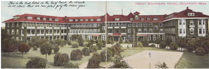
Great Southern Hotel, Gulfport, Mississippi. Circa 1913.

highlighted his vision of melding business ventures with improvements benefiting the general public.