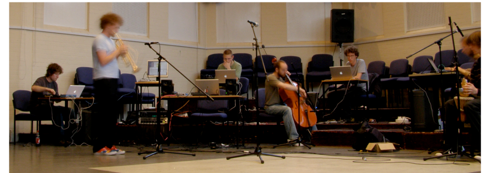
Laptop Concert Series

Experimenting with improvisation between laptop and acoustic instruments, making use of the purpose built NetMixer software.