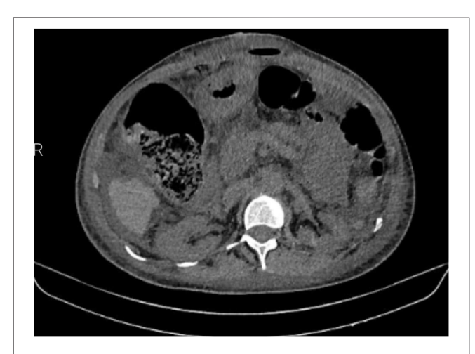
FIGURE 4 Abdominal tomography on the sixth postoperative day showing an intact abdominal wall with a small amount of supra-aponeurotic fluid.

discharged without signs of dehiscence or hernia recurrence and has been under outpatient follow-up.