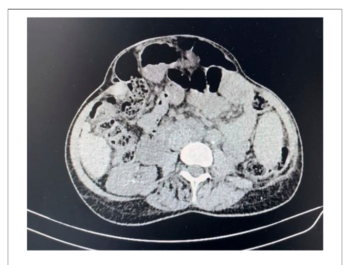
FIGURE 1 | Preoperative tomography showing incisional hernia.

Female patient, 62 years old, with a surgical history of exploratory laparotomy, total hysterectomy, bilateral oophorectomy, and