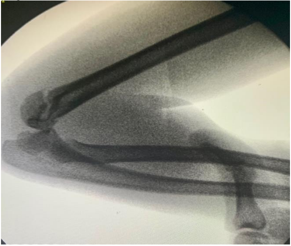
Figure 3- C arm image of Supracondylar fracture humerus

A 5-year-old ASA1 male child, weighing 20kg presented in the emergency department for K wire fixation of supracondylar fracture of the left humerus (Figure 3,4).