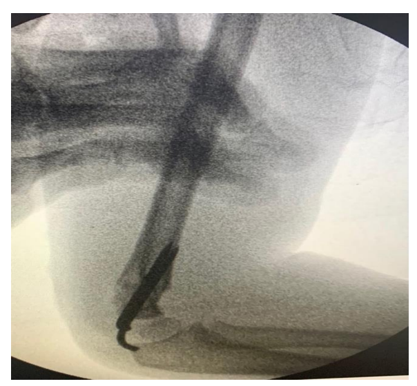
Figure 4- C arm image post K wire fixation of Supracondylar fracture humerus

Considering the age of the child and the surgical site, anaesthesia planned was intravenous (iv) sedation and supraclavicular block (SCB). After attachment of standard American Society of Anaesthesiologists (ASA) recommended monitors, the patient received premedication with inj. glycopyrrolate 80mcg, inj. midazolam 0.6mg and sedation with inj. ketamine 20mg.Then with the patient in supine position, the left shoulder was depressed with the head turned to the right side. The point of block needle insertion was just proximal to subclavian artery (SCA) pulsation in a posterolateral direction. We encountered persistent