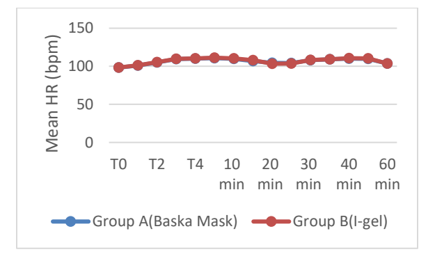
Figure 2- Comparison of mean heart rate between the two groups

Figure1- Oropharyngeal leak pressure between Baska Mask and I-gel measured just after insertion (T1) and after 5 min of creating pneumoperitoneum