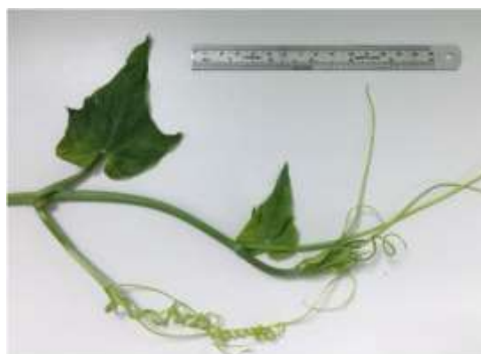
Figure 1. Chayote Shoot with tendrils, leaves, and stem together [18].

The 100 pieces of the 3 feet (0.93 m) plant stock were then cut into three (3) sections: top tier shoot, middle tier shoot and lower tier, each a foot