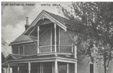
Holy Ghost Rectory, Vinita, Indian Territory. 1905