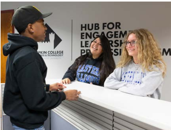
The Hub provides services to EIU students enrolled in the School of Business and School of Technology.

Lumpkin College introduced a new centralized location for student advising this past year – the Hub for Engagement, Leadership, & Professionalism.