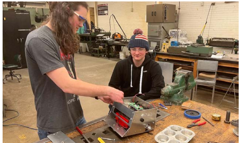
PICTURED HERE: Two EIU students preparing the SumoBot for competition.

The EIU Robotics Team represented the School of Technology in the Sumo-Robot and Micromouse Contests at the National Robotics Competition Marion, Ohio this past Spring. They took home a second place.