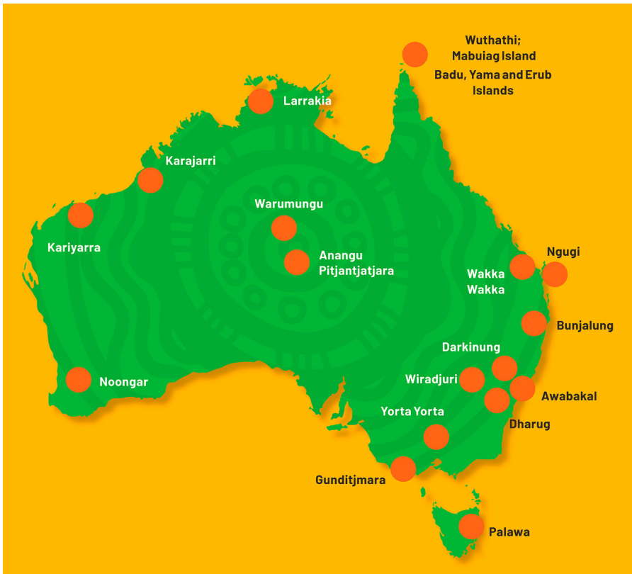
Figure 1. Map of community participant location and demographics.

Note: Refer to Continuous Improvement Cultural Responsiveness Tools for original image.