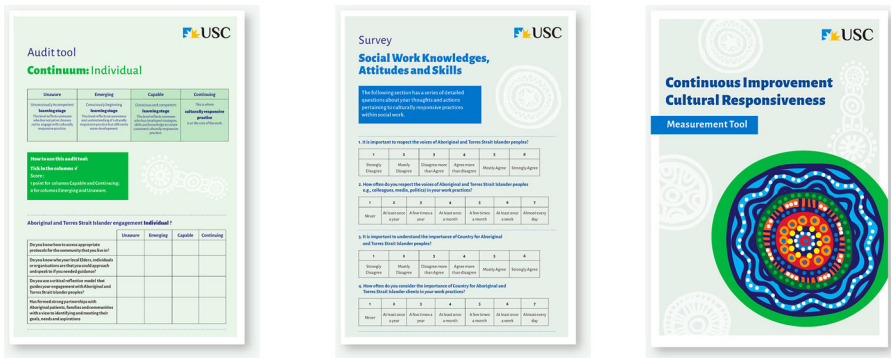
Figure 3. The Continuous Improvement Cultural Responsiveness Tools.

useful resources can be accessed to enhance the reader’s level of cultural responsiveness and understanding.