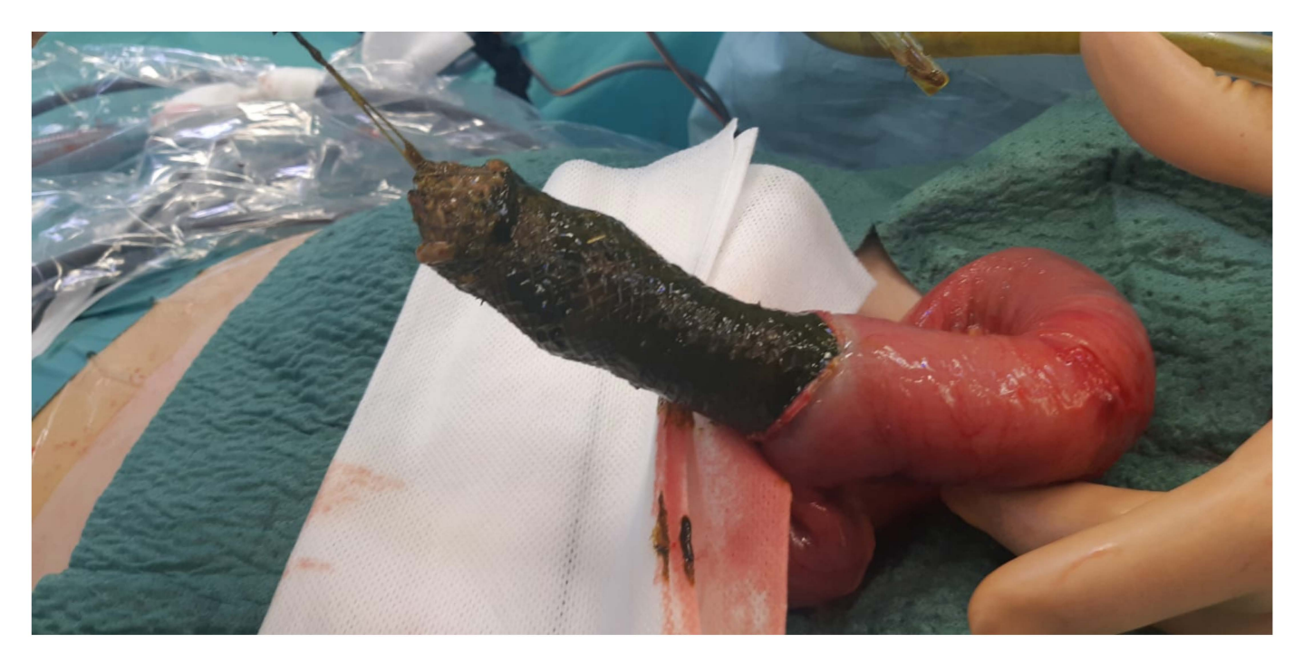
Figure 3. Migrated stent.