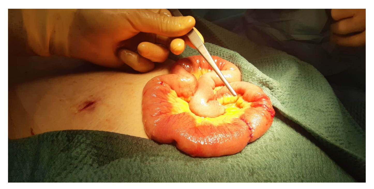
Figure 4. Final intestinal anastomosis.