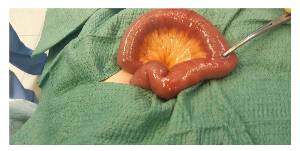
Figure 2. Obstructed ileus.

remaining leak at the esophagogastric junction. Postoperatively, the patient was admitted to the ICU for five days, until the recovery of a satisfactory respiratory function and later transferred to the surgical ward. The remaining hospital course was uneventful, and the patient was discharged in good clinical conditions with a progressive oral refeeding program. Gastroscopy and upper gastrointestinal series showed definitive healing of the leak with a blind pseudodiverticulum, which was treated endoscopically with the application of the Tisseel (Baxter Healthcare Corporation, Deerfield, IL, USA) fibrin sealant, which contains blood coagulation factors such as fibrinogen, factor XIII, thrombin, aprotinin (antifibrinolytic agent), and calcium chloride.