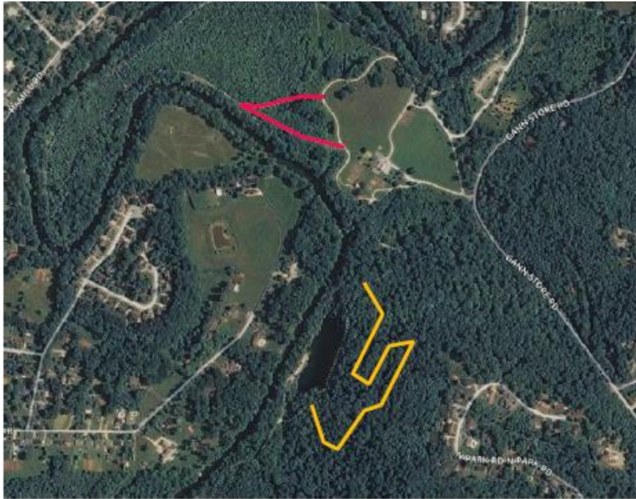
Figure 1. Netting sites at Greenway in Hamilton County, Tennessee. The Greenway site is marked in red, and the Bluff site is marked in yellow.

Eight mist nets (12 m x 2.6 m, 30 mm mesh) were set up at each site. Nets at Greenway were located at discrete positions no more than 20 m from the intruded trails. Nets at Bluff were located between 50-100 m from a less-used trail. Mist netting data were collected during the fall migration periods (late August-late October) of 2013 and 2014. Nets were opened within 30 minutes of local sunrise and checked approximately every 30 minutes until 1200 EST. Nets were closed when the ambient temperature exceeded 27° C, wind speed exceeded 10 km/h, or if more than a light drizzle was falling (Ralph et al. 1993). Captured birds were placed in cloth bags and walked back to a processing area; each site had its own banding area. Birds were banded with aluminum US Geological Survey leg bands, had their unflattened wing chords measured using a wing ruler, and weighed using an electronic balance. Visible subcutaneous fat was scored on a 6-point scale based on the one described by Helms and Drury (1960). As fat classes are a subjective measurement, they were assigned by the same observers (LKM at the Bluff site, DAA at the Greenway site) throughout the study to minimize inter-observer variation (Krementz & Pendleton, 1990).