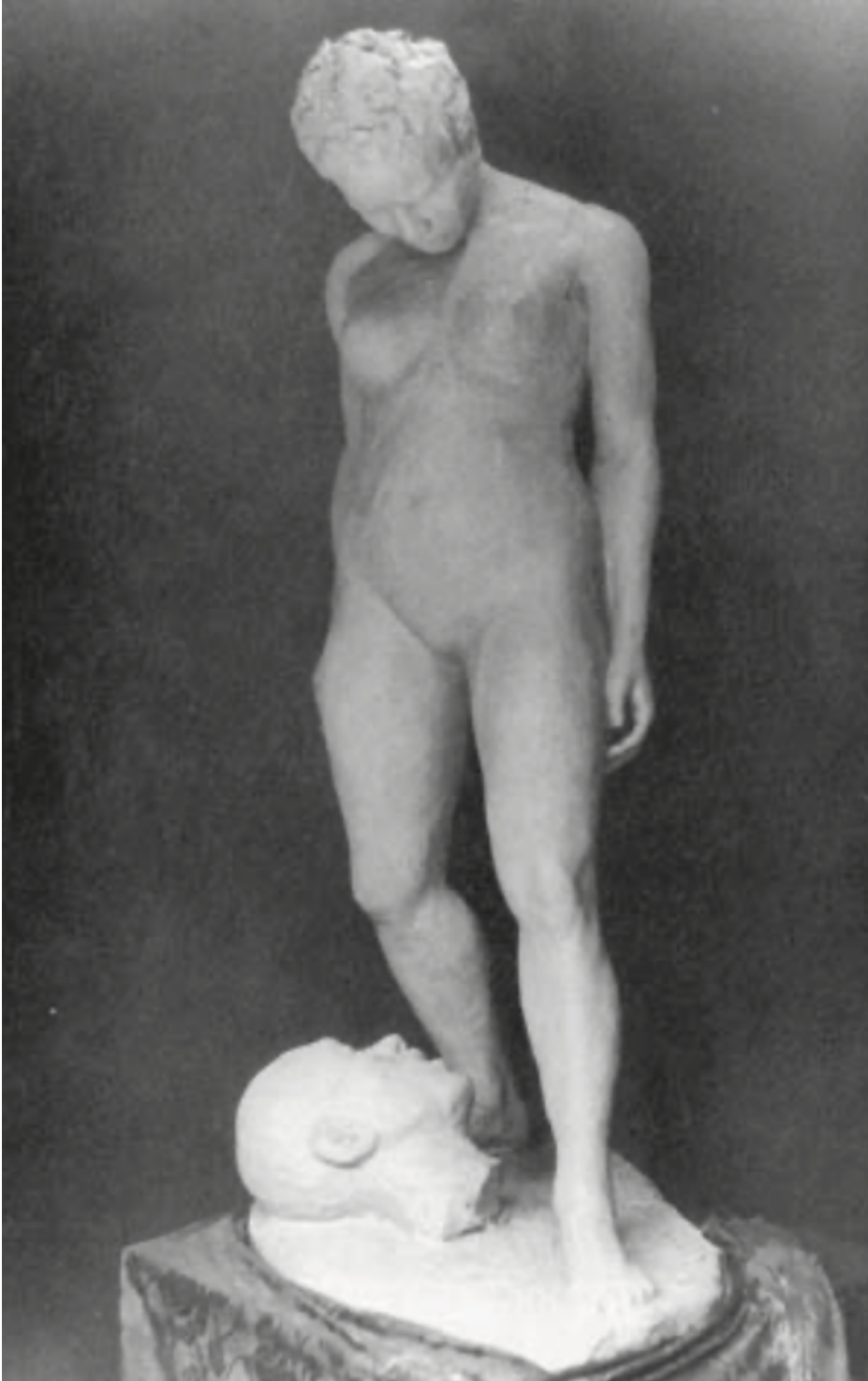
Figure 3. Mourning victory, ca. 1930 clay, dimensions and location unknown, Fisk University Library Special Collections.