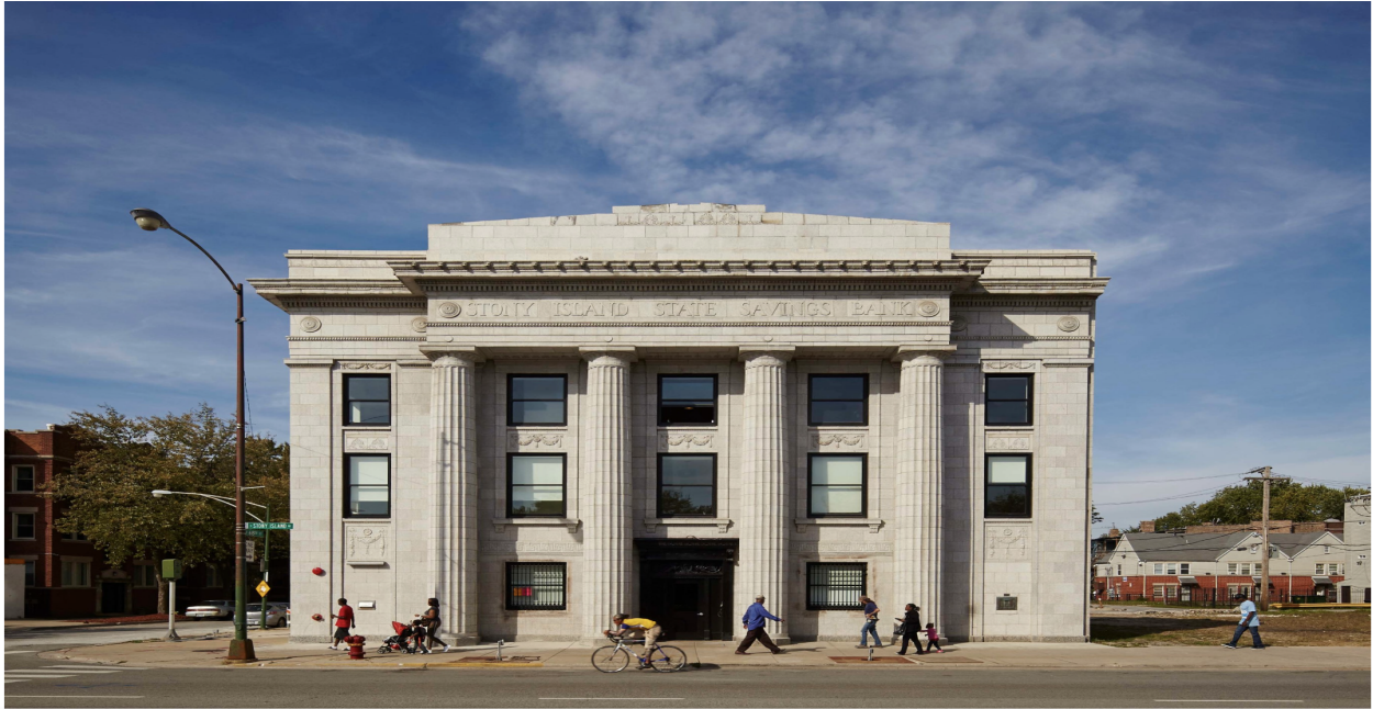
Figure 6. Stony Island Arts Bank