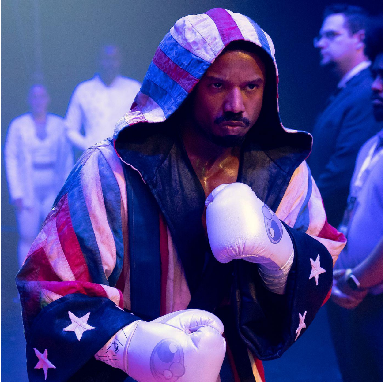
Figure 4. Photo of Michael B. Jordan playing Adonis Creed