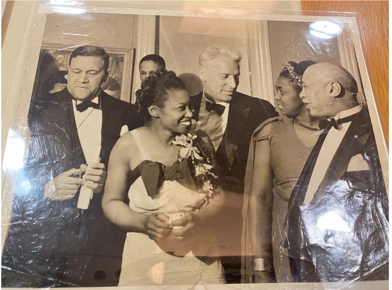
Figure 1. Left to Right: Channing Tobias, Augusta SAVage, Max Eastman, Selma Burke and W.C Handy- Opeining Salon of Contemporary Negro Art, June 7, 1939