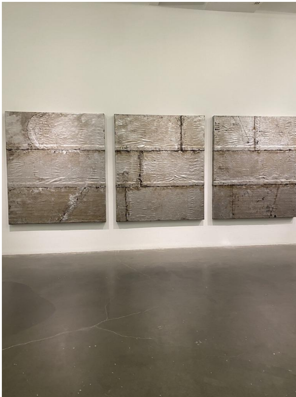
Figure 7. Theaster Gates, Seven Songs for Black Chapel #1-3 , 2022, industrial oil based enamel, rubber torchdown, bitumen, wood, copper, size unknown, Seven panels within the series.