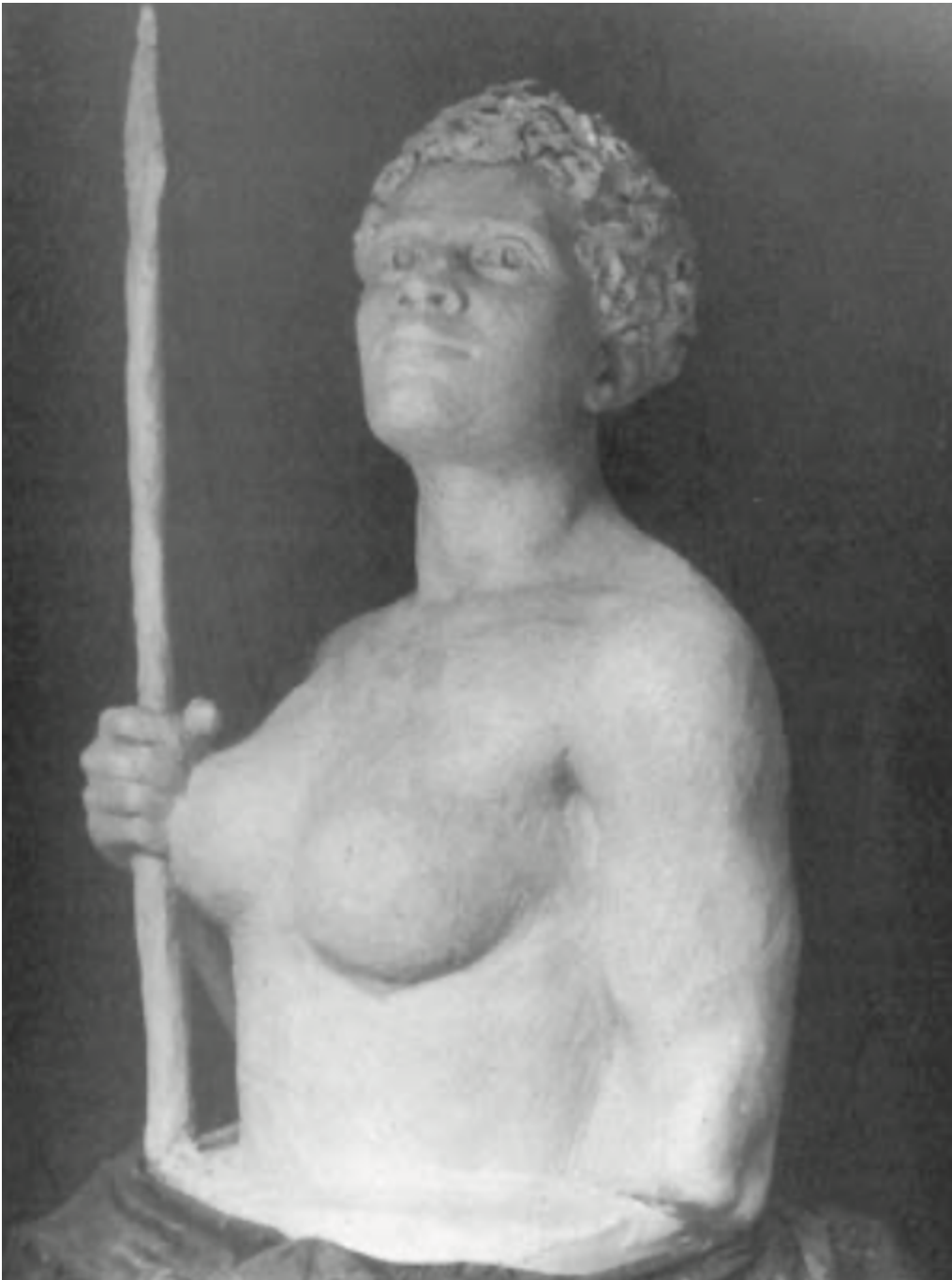
Figure 2. Augusta Savage, The Amazon , ca. 1930, clay, dimensions and location unknown. Fisk University Library Special Collections.