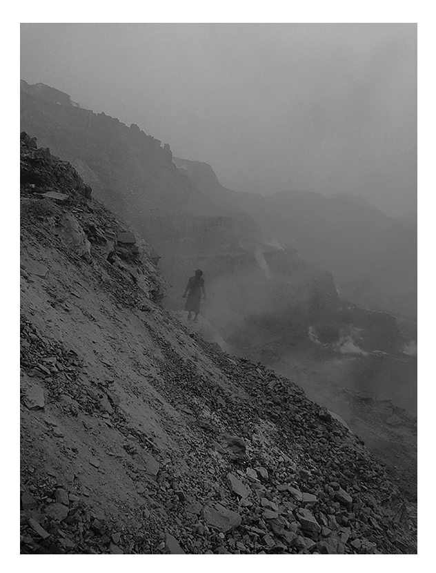
FIGURE 3.3 Underground fires have been burning for over a century in the coal town of Jharia. Photograph by Ronny Sen, c. 2016.