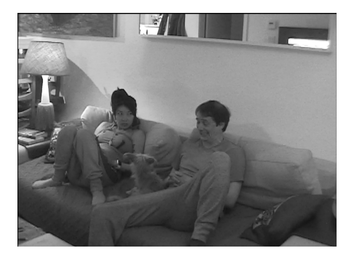
FIGURE 13.1 Shot on a mini-DV camera with a 4:3 aspect ratio, Coyote images our mundane pandemic lives under lockdown.

result of pandemic restaurant closures. Brown, drawing upon Native American mythologies of the coyote through Donna J. Haraway and Thomas King, explains that the coyote "emerg[es] when our attempts at planetary mastery have been thwarted and/or exposed as flawed" (Brown 2021). As a coyote, COVID-19 surfaced the racism and social inequities that only become more pronounced under such social duress while the Cinema-19 anthology, in allowing the films to bleed into one another, with no demarcation of one film's beginning or end, enabled intertextual interpretations, a "stream of consciousness" that mirrors its streaming digitality.