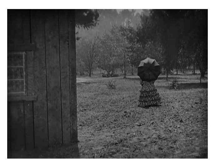
FIGURE 8.1 Keaton's Chimeric Horse (back view).