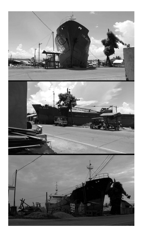
FIGURE 6.1 The ship Eva Jocelyn in Storm Children (2014) by Lav Diaz.

heap—accumulating images of debris, which is a symptom of the density piling of capitalism (Canlas 2011, 324).