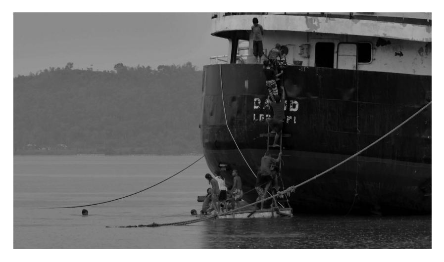
FIGURE 6.2 Play/struggle in slow motion in Storm Children (2014) by Lav Diaz.

"small glimpses of hope and joy;" thus the final shot looks like a simulation of what may have transpired during the storm and what the children needed to do to survive rather than a hopeful Hollywood ending.