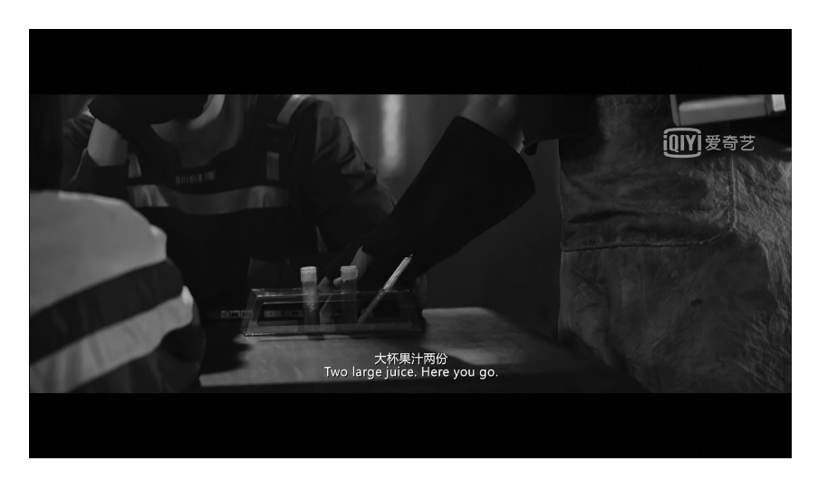
FIGURE 7.2 "Two large juices" are served in two small test tubes in The Wandering Earth .

toward this new protein source: it can be a daily staple, a fun snack, the precious gift, and a small luxury at a restaurant.