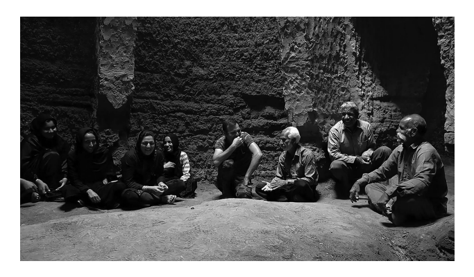
FIGURE 14.4 Residents discuss restoring water channels in a subterranean atrium.

disruption and calamity in and between the social and ecological worlds. The PV group frames their connection with water and its governance as a cyclical and sustainable relationship, or a hydrosocial cycle (Linton and Budds 2014), that emphasizes the dialectic and relational processes through which water and society interrelate and are continuously shaped by each other. The group presents this human ecosystem through activities, language, institutions, and infrastructures that show how water is highly valued and internalized within relationships and livelihoods among residents who live in a very arid and harsh climate. Fatemeh, for example, films children playing in the channels while she talks about the functionality of the waterways and laments their deteriorating state, presenting them as a place of work and leisure while evoking a shared memory of a thriving past. In another scene, a farmer talks about his livelihood and dependence on the channels as he digs out water trenches in his field, and in another, elder residents share memories of their youth in a carved subterranean atrium, admiring the water infrastructure as a site and symbol of their culture while they discuss hydrologic tools for improving water channel management