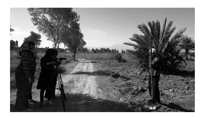
FIGURE 14.1 Takab PV members interviewing other residents about water channels.

Along with the articulation of behavior, certain aesthetic activities and expressions are also delimited and dictated by gender. Gendered norms and regulations can call for differences in the use and specialization of materials, media, and subjects based on access and exposure to certain gendered knowledge sets, opportunities, and spaces. Throughout Iran and certainly in Takab, activities associated with fiber media (weaving, stitching, sewing, etc.) are primarily mastered by women, though generally appraised and sold by men. This often results in a marginal portion of the profits returning to the female artisans and a larger share returning to the male brokers. The first part of the PV team's social activism, therefore, involved reviving needlework practices among a younger generation of women who aspired to collectively manage the sale and production of pieces and improve their profits through the development of an artisan cooperative. These trainings and working sessions gave women a rare opportunity to convene and communicate in an intimate yet public environment (Figure 14.2).