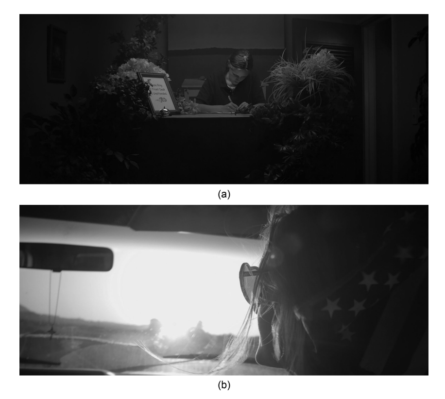
FIGURE 13.3 Kin experiments with sympathy through alluring cinematography.

slack, or Netflix ambience, offers the (mis)use of Netflix as background noise, an aural screen but which is nevertheless "narcotic and culinary" without depth (Stam 37). We are uncomfortable relinquishing the ostensible mastery we have over the basic, good-enough Netflix show, which we may watch in distraction and still feel we comprehend (well enough). Therefore, we desire the slack in our home spaces, since it offers a sense of control over our environment, a place of refuge from the chaos out there - a stark contrast to MacDonald's notion of slow cinema as a refuge for immersion in, and becoming with, nature/the out there. On the other hand, some challenging films are also "slack objects" in that they resist such legibility, offering a kind of transitional play that is aggressively destructive, but which is also a necessary aspect of comprehending aliveness. I caution that it is precisely these types of slack objects that are the first to be excised in festival programming, as I have witnessed during my time as a programmer, and particularly under the domestic-aesthetic constraints of the online fest, which will be even more risk averse than a traditional festival because of its aesthetic competition with televisual films and shows, which however complex, were designed with streamification in mind.