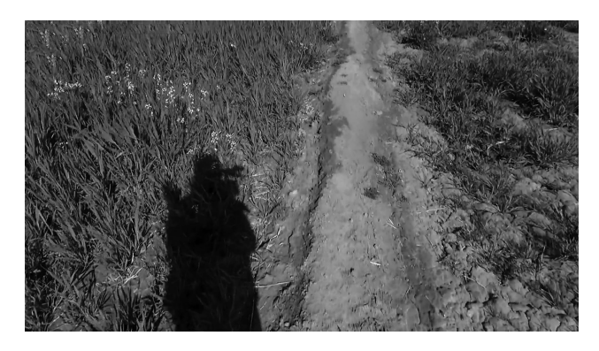
FIGURE 14.3 Zahra taking a walk through the village.