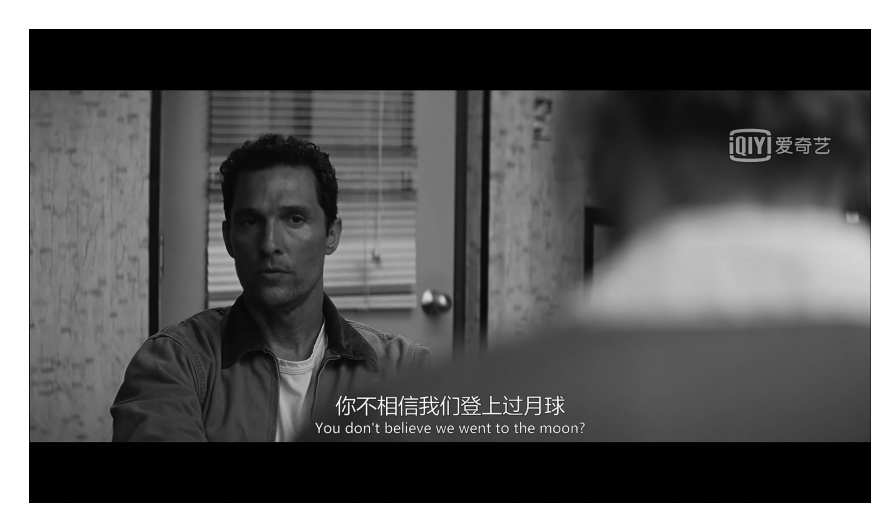
FIGURE 7.1 Cooper attending a parent-teacher conference in Interstellar.

Cooper, and by proxy, Murphy, significantly attacks only the veracity of the Apollo moon landing itself and not an education board's decision to disseminate this revisionist history, which frames past US space exploration as a move to bankrupt the former Union of Soviet Socialist Republics. By glossing over the pedagogical choices that shaped the textbook and the broader ideological programming it supports, Cooper implicitly focuses his resistance on the politicization of national space programs. The constituted ideological focus asserts that Cold War politics did not play a role in the Apollo moon landings and should not diminish that great techno-scientific achievement. As such, a sequence ostensibly about Murphy's savvy and rebellious spunk is actually about a privileged white man angrily asserting that space exploration and the planetary ecological crisis are apolitical, ahistorical demonstrations of a universal human call to explore. In short, an ideology with more than a whiff of Musk (Elon, that is). Murphy is thereby introduced as an echo of her father and the fantasy of patriarchy free from history, politics, and ideology that he believes he embodies.