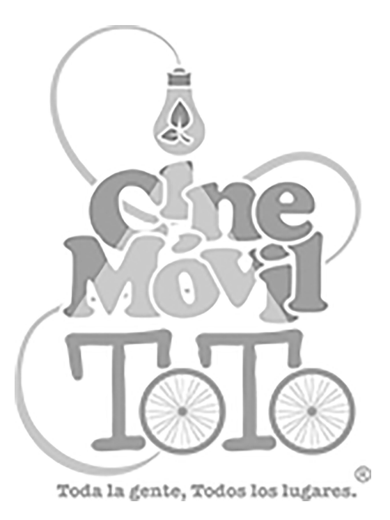
FIGURE 2.2 The Cine Móvil ToTo logo.

ToTo's communication director. This output varies based on human capacity, error, and distractibility—variables that are particularly salient given the high involvement of enthusiastic youth. Because of these limitations, bikes are used to power the audio console, speakers, Blu-ray, and other equipment that do not require continuous high-volume energy. The projector, by contrast, has higher energy demands (400–500 watts) and is powered by solar panels to assure its seamless operation. These solar panels are strapped to the ToToneta (the van), where they charge during the trip, and are then placed near the venue to charge in advance of the show.