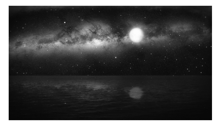
FIGURE 10.1 Milky Way animation in "Time Dreams"; courtesy of director Missy Whiteman.