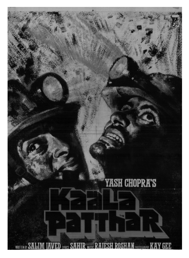
FIGURE 3.1 Heroic figurations of the Indian coalminer, as crafted by public coal companies, made their way into Kaala Patthar's publicity design.

nationalization in a period when frequent coal catastrophes were taking place under the state's watch.