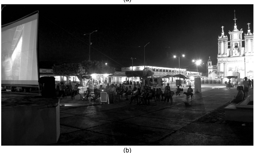
FIGURE 2.1 A Cine Móvil ToTo screening in Tabasco in 2021.

The ToTo team drums up viewers through prior publicity, as well as on the day of the event through a loudspeaker attached to the van affectionately called the ToToneta. Armed with a catalog sponsored by IMCINE of a dozen domestic films, the team gives a brief synopsis of the available options to the audience. The public then votes on which film to screen. Often, family-friendly films prevail, like the animated film La leyenda de la Llorona ( The Legend of La Llorona , Alberto Rodríguez, 2011), since Cine Móvil ToTo tends to draw families and young people. Other films featured in the 2021 offerings included