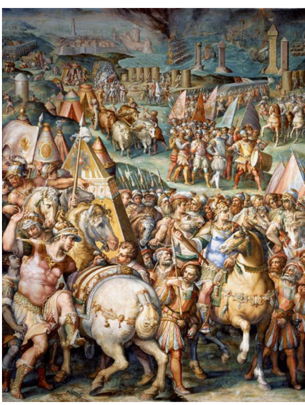
Fig. 2. Giorgio Vasari, Emperor Maximilian Lifting the Siege of Livorno , fresco, Salone dei Cinquecento, Palazzo Vecchio, Florence, 1563-65.

in Reims, Lyons, Nantes and Ferrara, among others, present vivid examples. Naval battles in festivals struck contemporaries in their wondrous but terrifying displays of fire on water, whether in the form of fireworks, firearms or, in some cases, water literally set on fire. Sources reveal how such spectacles of water and fire conveyed a performance of destructive power, one altogether fitting given the terrifying experience of real maritime warfare underway at this time.