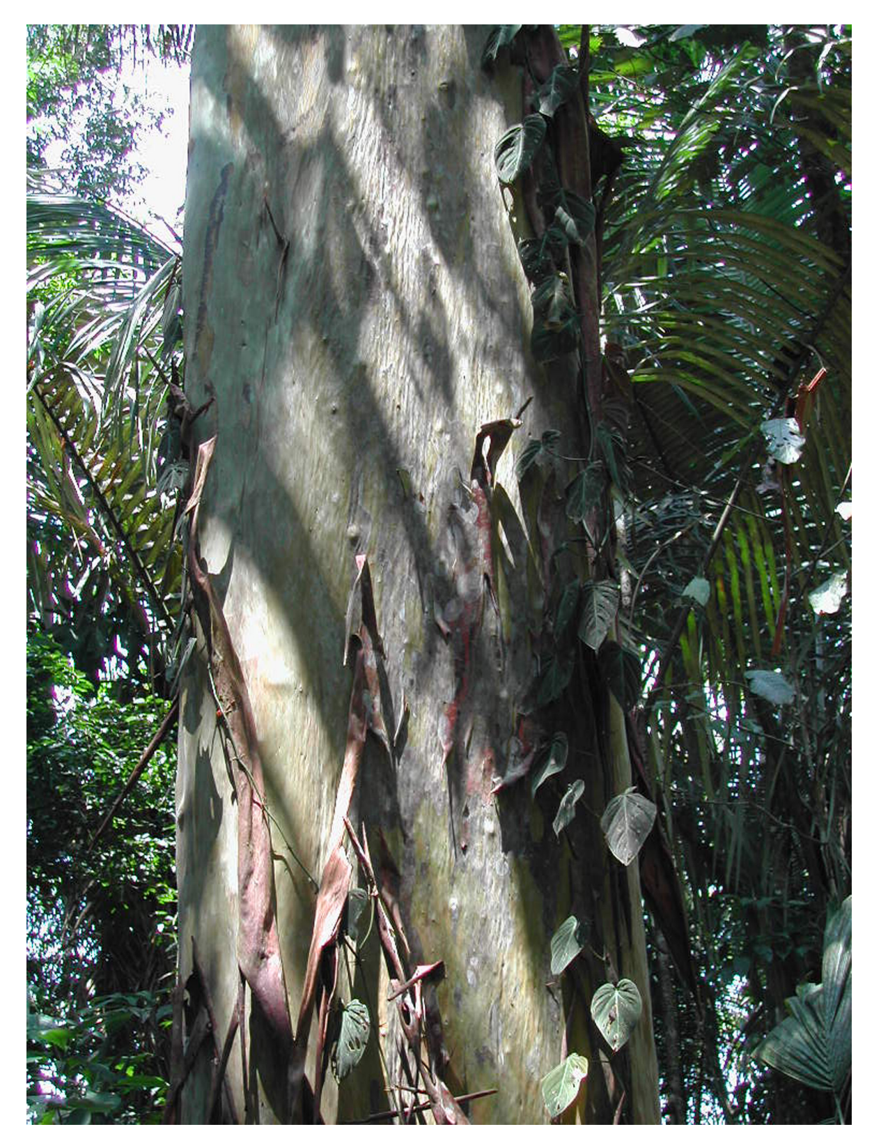
Photo 4. Only a fraction of all Amazonian tree species are considered as timber species: stem of an adult Calycophyllum spruceanum tree. Tambopata National Reserve, Perú.