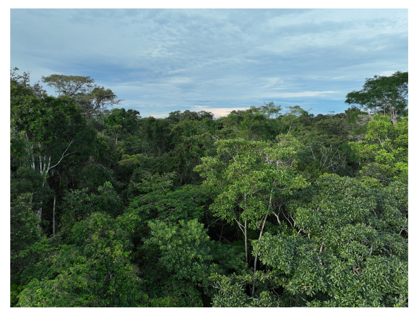
Photo I. A typical view of an Amazonian hyperdiverse forest: the Tiputini Biodiversity Station situated inside the Yasuní Biosphere Reserve, Ecuador.