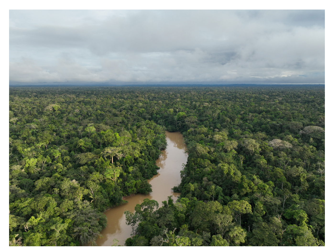
Photo 3. Amazonian rivers define most of the forest ecosystems: view of the Tiputini River at the Tiputini Biodiversity Station, situated inside the Yasuní Biosphere Reserve, Ecuador.