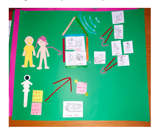
Fig. 3. Brainstormed solution for Building Parenting Skills in Soweto

include a digitised "Road to Health booklet" (RTHB)<sup>10</sup>, a government resource that assists mothers in the first 1000 days of childcare, and educational videos by doctors and nurses. Community participants expressed that these educational videos would also include video content for babies, with a caution that babies and toddlers should not spend more than two hours each day in front of a screen. People with smartphones would access these resources by connecting to the CWN from their homes, and those who do not own smartphones can access the resources at the community centre, using tablets that can be provided by community leaders.