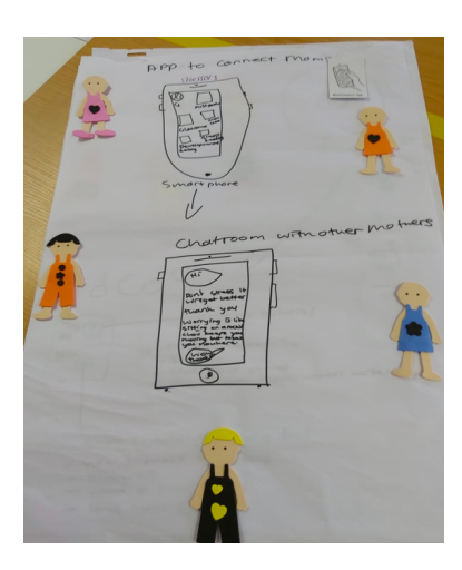
Fig. 5. Brainstorm of Parental Well-being in Cape Town: chatroom application for mothers with similar stressors

MCH priorities. Along with facilitating language translations, integrating tribal and local leaders in the research space facilitated engagement of the community members. Furthermore, the cultural leaders in the rural sites created a familiar and culturally safe space for community members to feel comfortable and supported by their community leaders when expressing themselves. For instance, the community leaders often initiated the more sensitive topics when the other community participants were more quiet and shy to speak about them. For example, the male community leaders in Limpopo started the conversation about "Involving Fathers" by stating: