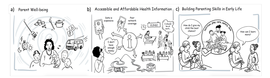
Fig. 2. Highest-ranked Challenge Cards: a) Parent Well-being, b) Accessible and Affordable Health Information and c) Building Parenting Skills in Early life

In Figure 2, the highest-ranked priorities discussed in this section are shown.