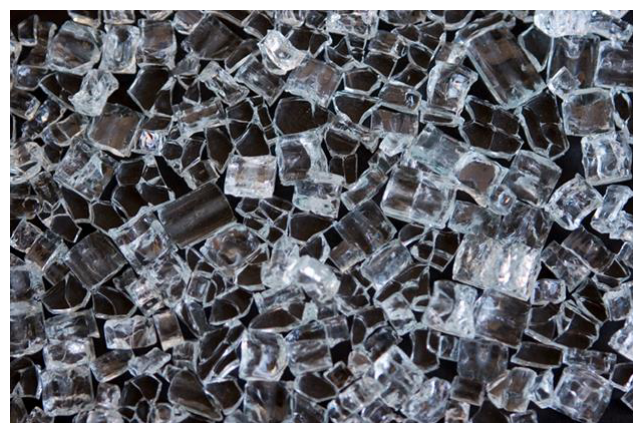
Fig. 4. Particles of CRT glass

Other research [10] found that if used different replacement levels of CRT (0%, 25%, 50%, and 75%) would get different flow speeds and consistency. CRT glass has a smooth surface and is impermeable in nature. Other studies [11,12], as well, showed that the consistency of these mixes is decreased if there is less percentage of CRT. What is evident is that if a higher percentage of CRT glass is used, a more homogeneous mixture is obtained, with less segregation (Fig. 4.).