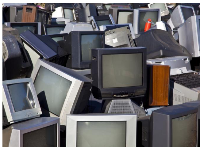
Fig. 1. E-waste

environmental preservation, especially the development of a "circular economy", which implies the efficient use of materials. As technology advances, the amount of waste increases significantly, and the depletion of natural resources becomes irreplaceable [3]. There is a pressing need for recycling or reuse of various waste materials, and the development of sustainable alternative methods to manage hazardous waste. Collected data last few years from the waste electrical and electronic equipment (WEEE) collection and pretreatment market states that roughly 50,000-150,000 million tons/year of cathode-ray tube glass (CRTs) are collected in Europe only, and this quantity is not expected to decrease in coming years. The widespread use of liquid crystal displays (LCDs), light-emitting diode (LED), and plasma display panels that replaced CRTs are dramatically progressing, producing a million units of waste (Fig. 1).