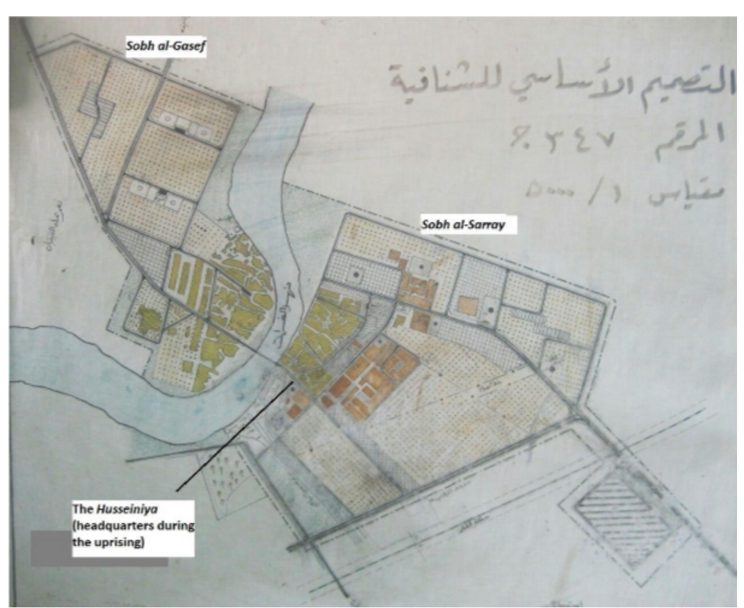
<sup>16</sup>Map highlighting the significant locations during the Intifadah in Al-Shinafiyah

The following interviews comprise the first set in this collection and are all from members of one family that come from Al-Shinafiyah located in the Diwaniyah Governorate. Through the experiences and perspectives of a father, a son, a daughter, and granddaughter, we gain insight into the impact of the uprising on different generations within the same family. Their stories offer a glimpse into the complex nature of life during this tumultuous period in Iraqi history.