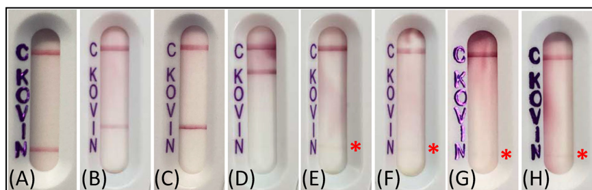
FIG 3 Representative NG-Test CARBA 5 results for other isolates tested with an “extra heavy” inoculum. Additional isolates were tested with an extra heavy inoculum (1/2 of 10- \mu L loop) on NG-Test CARBA 5, and the following representative examples are shown: (A) NDM-positive K. pneumoniae ATCC BAA-2146 (standard inoculum testing of a true-positive NDM isolate is shown for visual comparison to other LFAs), (B) IMP-positive E. coli NCTC 13476, (C) IMP-27-positive PR1, (D) KPC-positive MMOR6, (E) non-carbapenemase-producing MMOR5, and (F) technical replicate of MMOR5, (G) non-carbapenemase-producing MMOR3, and (H) technical replicate of MMOR3. The red asterisk highlights the false-positive NDM band that appeared in two of 10 other isolates tested with an extra heavy inoculum.

The NG-Test CARBA 5 LFA is FDA-cleared for testing colonies of carbapenem non-susceptible Enterobacterales and Pseudomonas aeruginosa . A prior study showed that this assay is highly sensitive and specific for detection of the five most common carbapenemases produced by these organisms (19). Other studies have reported false-positive results for the assay. Zhu et al. reported an IMP-4-producing Enterobacter cloacae that generated an IMP band and a weak false-positive NDM band on NG-Test CARBA 5 (20). Hopkins et al. reported an NDM-producing isolate that generated a false-positive