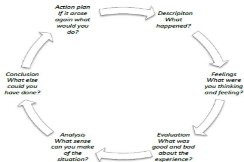
Figure 1. Gibbs' Reflective Cycle (adopted from Lia, P (2016))

Reflective learning emphasizes that learning comes from experience and can be updated continuously through the process of recording/recording and thinking about the experiences you have. In Higher Education, a high worth is set on the skill of being a reflective learner. This implies students can fundamentally assess their learning, recognize spaces of their learning that are required for an additional turn of development, and make themselves more independent learners. The Gibbs Reflective Cycle identifies 6 stages of reflection that help learners to understand their learning as shown in Figure 1.