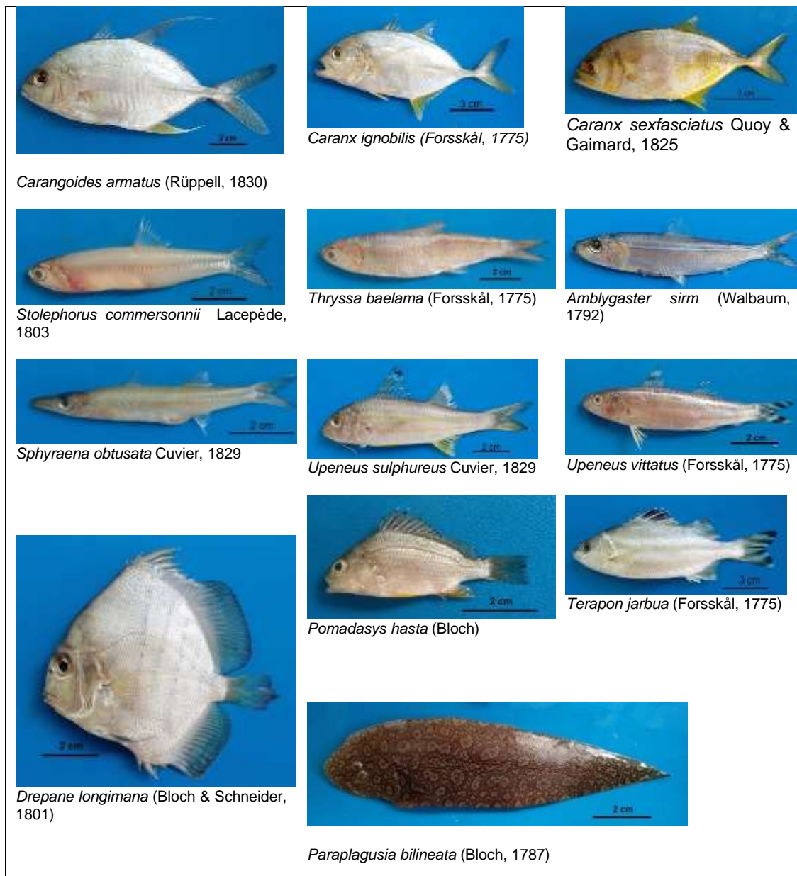
Figure 1. Migrant species of Tondano River Estuary