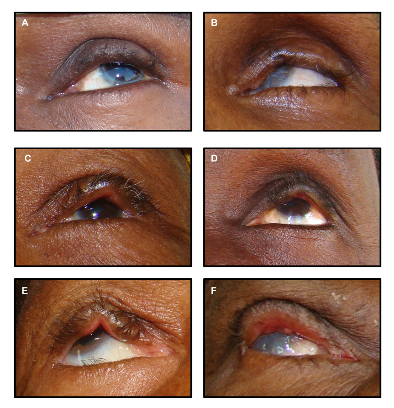
Figure 1. Standard photographs showing examples for each grading category. A and B) Mild eyelid contour abnormality C) Moderate abnormality based on height of deviation D) Moderate abnormality based on length of deviation. E) Severe abnormality based on height of deviation. F) Severe abnormality based on length of deviation. doi:10.1371/journal.pntd.0001713.g001

week post-operative photographs from the PRET trial. Clinical definitions characterizing the amount of vertical deviation and/or horizontal extent of the deviation were defined to delineate measurable differences in outcomes (Table 1). We found that also providing lay definitions assisted in training the photograph graders by providing a frame of reference. We asked them to imagine speaking to the patient at a conversational distance and then to determine whether they could see the ECA. Mild deviations would not be visible when standing at a conversational