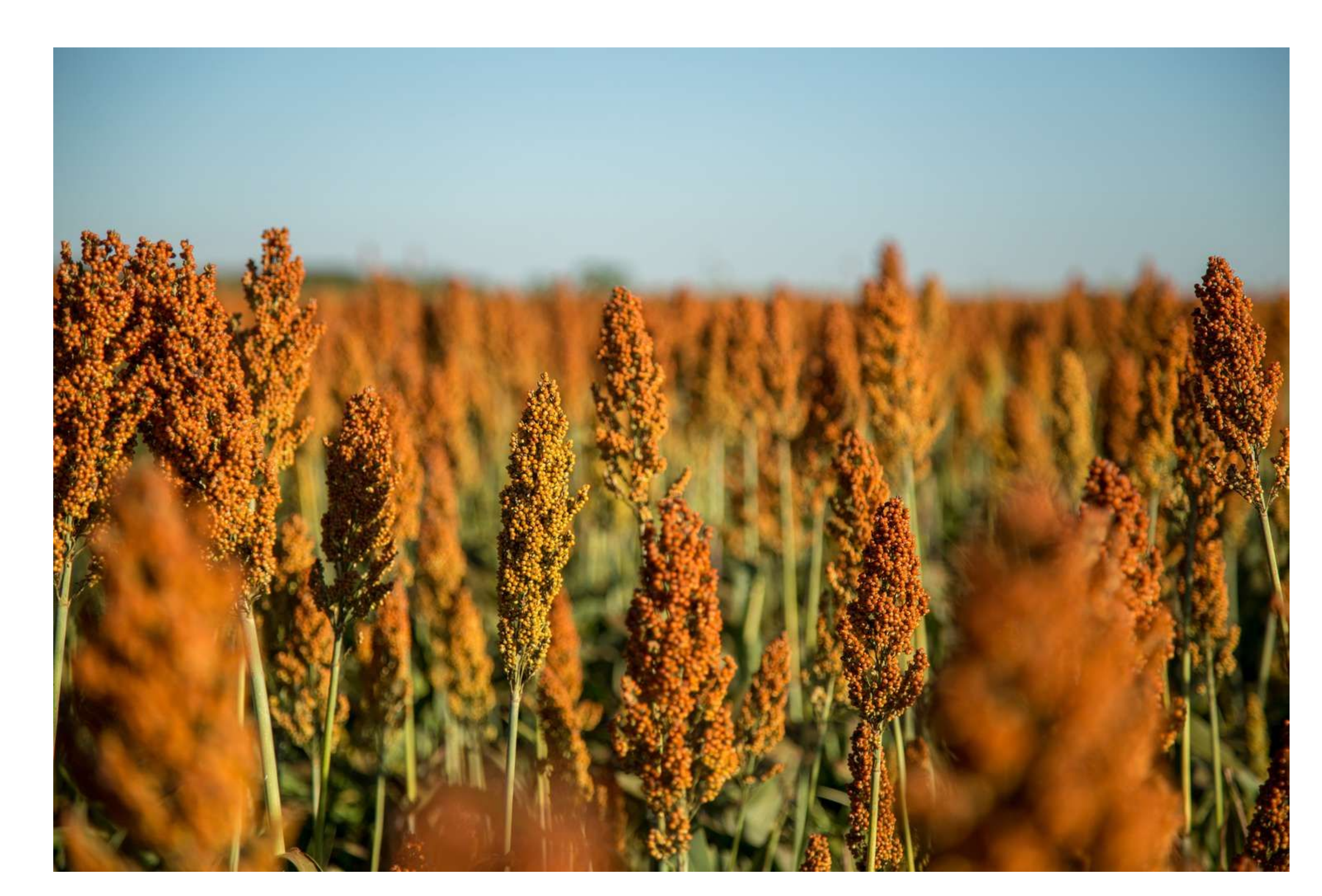
Figure 1. Field of sorghum bicolor maturing for harvest

Sorghum is a next generation of crop species for food grain, feedstock, beverage and biofuel production. To discover highly desirable agronomic traits in sorghum, we analyzed 3.42 billion DNA sequences derived from 30 sequenced sorghum landraces using next-generation sequencing (NGS) technology. Using the BWA short reads aligner, 97% of the sequenced reads mapped successfully to the sorghum reference genome. Using the SAMtools variant-calling algorithm, we detected 68.14 million mutations, including 61.32 million DNA base substitutions or single nucleotide polymorphisms (SNPs) and 6.81 million insertions and deletions (INDELs). In our preliminary analysis using the snpEff variant annotation tool, we predicted a total of 134,207 high-impact mutations and 1.81 million moderate-impact mutations in the 30 sequenced sorghum landraces.