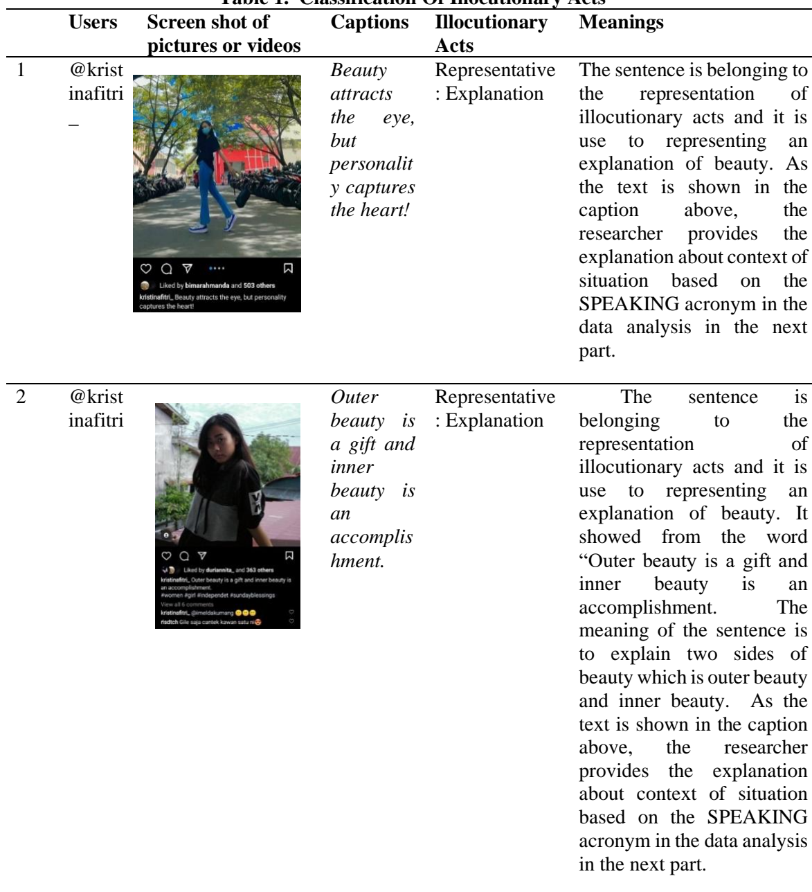
Table 1. Classification Of Illocutionary Acts

The researcher applied a pragmatic study to conduct this research. There is 13 users of Instagram who being the participants in this research and the researcher only found 7 accounts from 13 participants who write English caption that contain some types of illocutionary speech acts and the researcher started by displaying the data and distinguish them based on the types of illocutionary speech acts and the context of the situation (SPEAKING acronym) in identified the data to find out the illocutionary acts using Searle (1976) theory of classification of illocutionary acts. He classified the illocutionary acts into five types; representative, declarative, directive, expressive, and assertive. Therefore, the researcher only displayed four data as the example of this research with its explanation from SPEAKING terms. Thus, the data as followings: