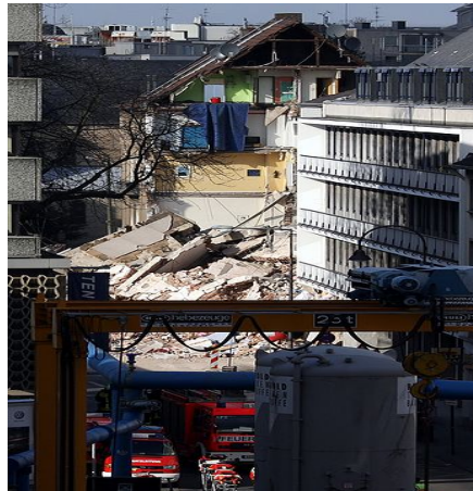
Figure 1. Collapse of the Cologne archives building in March, 2009. [11]

geological models of the shallow subsurface - the Mapping the Underworld project [7] and the VISTA project [9]. The BGS has already undertaken collaborations with members of both these research teams to identify appropriate methods for mapping the locations of existing buried utilities [10]. The importance of accurate subsurface information is clearly demonstrated when unanticipated conditions lead to failures during construction of new underground works. For example, the collapse of the building containing all of Cologne's archives on March 3, 2009 occurred as the new Cologne subway was being constructed along the street in front of the building [11] (Figure 1). This has resulted in the loss of large amounts of Cologne's historical records extending back over a millennium and among the most extensive in Europe. Thus the loss to society is considerable.