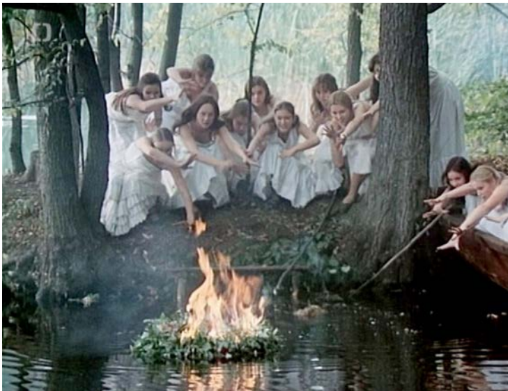
Fig. 5. Forest rituals (third movement).