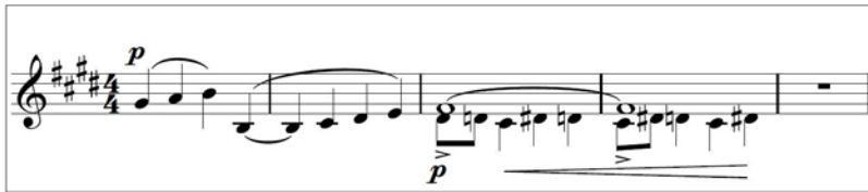
Fig. 3. “Love Theme”.

Sís managed to insert a non-musical content into the originally non-programmatic composition in some places, namely a meeting and a love affair of two people. A suitably chosen place in the second half of the composition completes the mood of this inner storyline. It is no coincidence that “Love Theme” or “Love Song” is used for this musical theme.