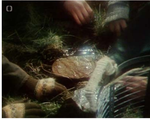
Fig. 6. Exterior scene showing the cleaning of wells.

With the second film, Dvořák's Symphony No. 9, The Opening of the Wells shares folklore elements and a rural environment. Scenes depicting the ceremony of cleaning wells, as well as studio shots, are permeated with folk themes.