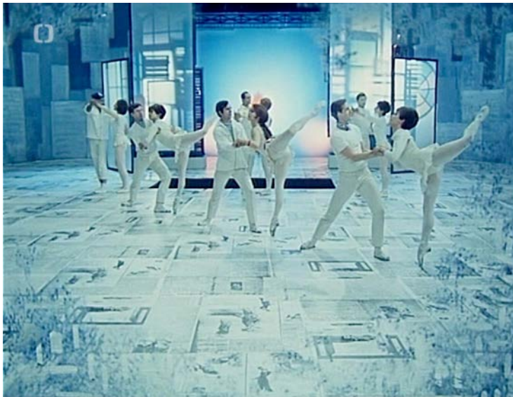
Fig. 2. Studio shots with dance numbers.