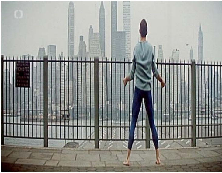
Fig. 1. New York City sequences.