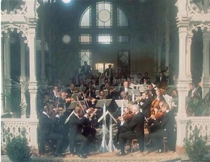
Fig. 4. Stylized concert shots. Source: Antonín Dvořák: Symfonie č. 9 e-moll, op. 95 . „Z nového světa“ [film]. Directing Vladimír Sís. Czechoslovakia, 1977.