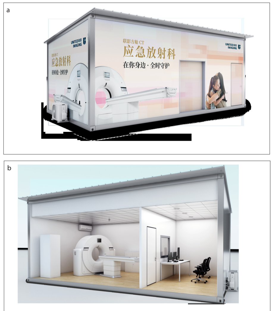
Figure 1. a, b. The detachable lead shielding room of the container CT (a) and its virtual side view (b) showing the whole CT scanning and control rooms.

The detachable lead shielding room has its own air conditioner and dehumidifier to ensure that the temperature and humidity,