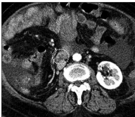
Figure 3. Follow-up axial contrast-enhanced CT scan 3 days after coil-assisted retrograde transvenous obliteration confirmed obliteration of the efferent vein and duodenal varices ( dashed circle ) in the third portion of the duodenum.

ciated with gelfoam use. Drawback of this technique was that we could not visualize the entire vascular structure before coil embolization because we used a retrograde approach. However, duodenal varices can be successfully embolized as long as microcatheters advance deep enough to avoid