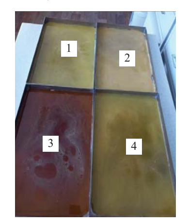
Fig. 1. Frozen honey samples: 1, 4 – sunflower; 2 – sweet clover; 3 – mountain

Preliminary samples of frozen honey samples under study at temperatures: -20 °C, -30 °C and -40 °C are shown in Fig. 1.