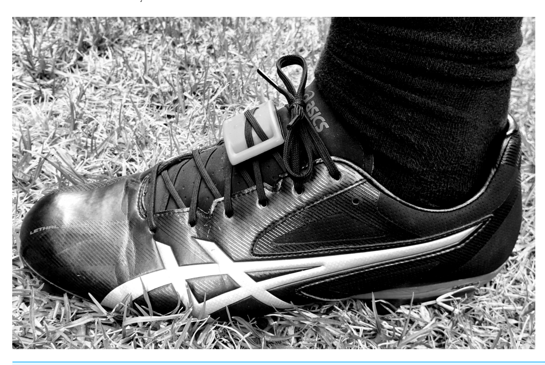
Figure 1 Accelerometer placement on boots.