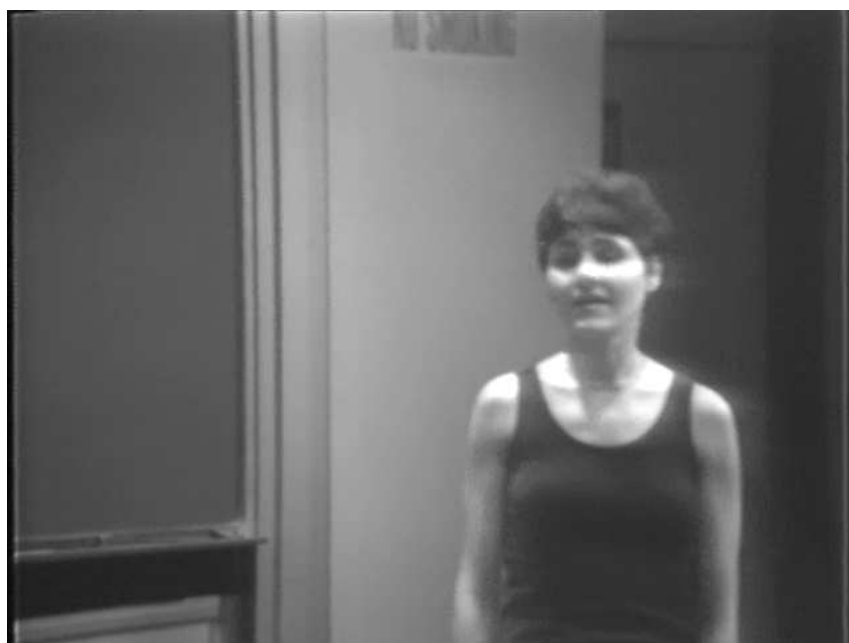
<Figure 5.mov (video) here>

Figure 5 shows a number of five-step movements with turns. The turns to the audience are at times more pronounced and seem to take longer than those previously presented. In general this is due to the speaker orienting to the audience with gaze 'within' the turning movement.