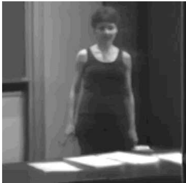
<Figure 7.gif (Gif here)>

As seen above (Figure 6), the continuous turn may include gestures. This is also the case with the incremental turn. Here, the pause in the turn movement is utilised to produce a set of embodied actions.