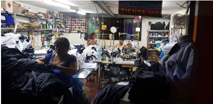
Figure 3. Textile manufacturing company