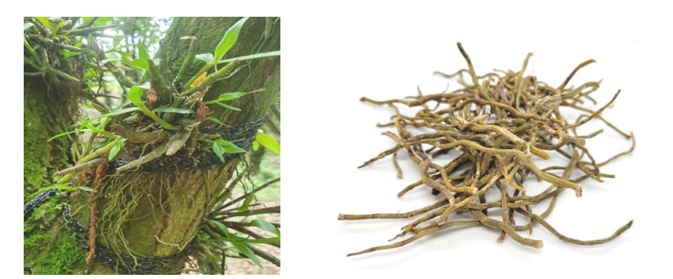
Figure 1 Author's photographs of Dendrobium officinale in plant and dried Tiepishihu form.