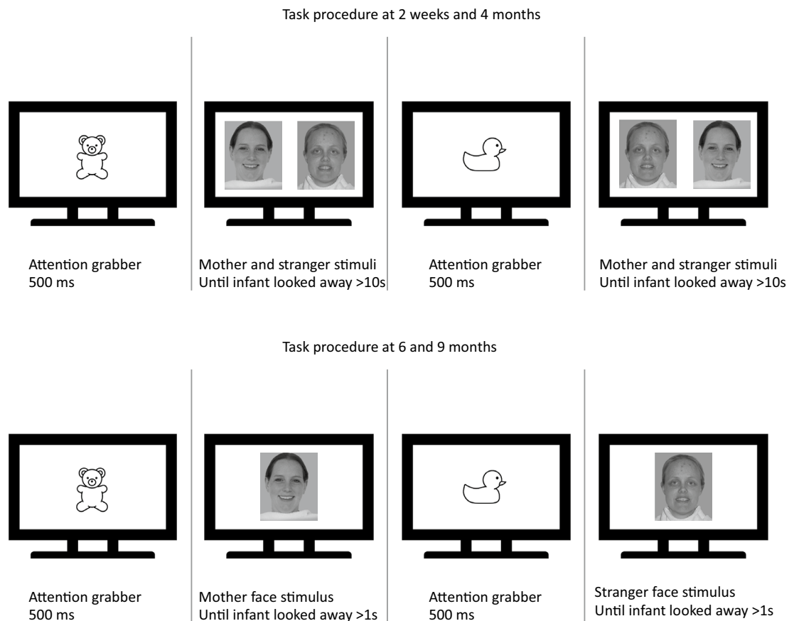
Figure 1. Visual preference task protocol used at 2 weeks and 4 months (top) and at 6 and 9 months (bottom). The image is for illustrative purposes only.

Looking time data were coded by two independent coders using video recorded sources from both the eye tracking system and the high-speed camera. This combined method was employed to ensure a more accurate coding and inclusion of data samples which would have been otherwise lost by each of the recording systems separately (for a comparison between automatic eye tracking and manual coding, see 47 ). Gaze data and video frames were synchronised with stimulus presentation via a small hidden area at the bottom corner of the screen that was lit up when stimuli appeared. The illumination state of this area was detected by a light sensor, transmitted to a