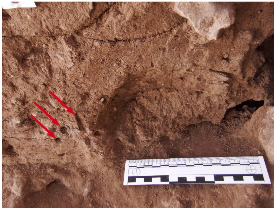
Fig. 5. Ancient insect burrows (arrowed) in the trench wall, in deposits ~15 cm below the location of Shanidar Z and very close to the level of new, unpublished, fragmentary Neanderthal remains, photographed in May 2022. The sandy fill of the middle burrow is particularly apparent. Looking North, scale measures 15 cm.

level have been illuminated by artificial light, whereas it would seem from his accounts of the excavations (e.g. Solecki, 1961, 1971) that Solecki did not use artificial light while he was excavating. It is thus quite likely that he was unable to see bee burrows in his excavations at depth, as in the Shanidar 4 zone. Bee burrows could, however, be felt by the current excavation team while trowelling, so Stewart, who excavated around Shanidar 4, might have noticed them even if he could not see them.