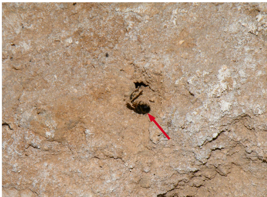
Fig. 2. Solitary bee excavating a burrow on the section wall of our trench in Shanidar Cave photographed September 4, 2022. The bee has broken through a whitish efflorescent crust into slightly-consolidated sediment behind. The insect is head-down in the burrow, spraying loose sediment out of the hole with her legs. Her abdomen is arrowed.

To produce mixed clumps of pollen, another mechanism than straightforward deposition of flowers (whether by Neanderthals or by burrowing birds) must have been operating. The most likely is that the pollen was accumulated by nesting solitary bees. The pollen loads of