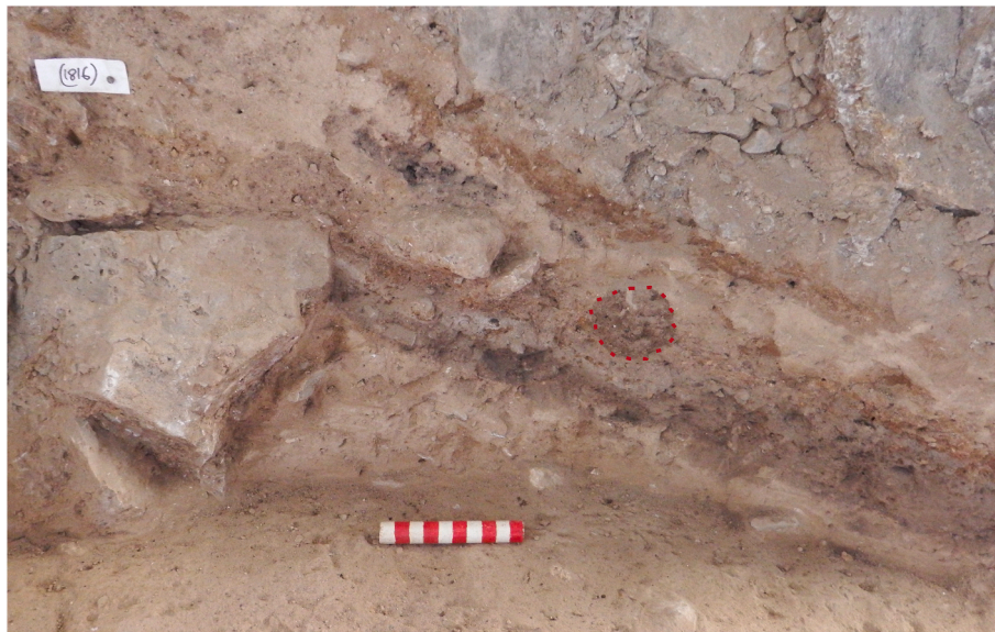
Fig. 6. Ancient rodent burrow in the trench wall, less than 1 m stratigraphically below and approximately 4 m to the East of the location of Shanidar 5, photographed in September 2018. Scale measures 10 cm, looking South. Burrow outlined by a dashed red line. (For interpretation of the references to color in this figure legend, the reader is referred to the Web version of this article.)