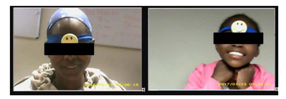
FIGURE 1 Parent and adolescent view of the Teencam footage

on a built-in SD card. These Teencams were used to record observational tasks conducted with the BAG participants.