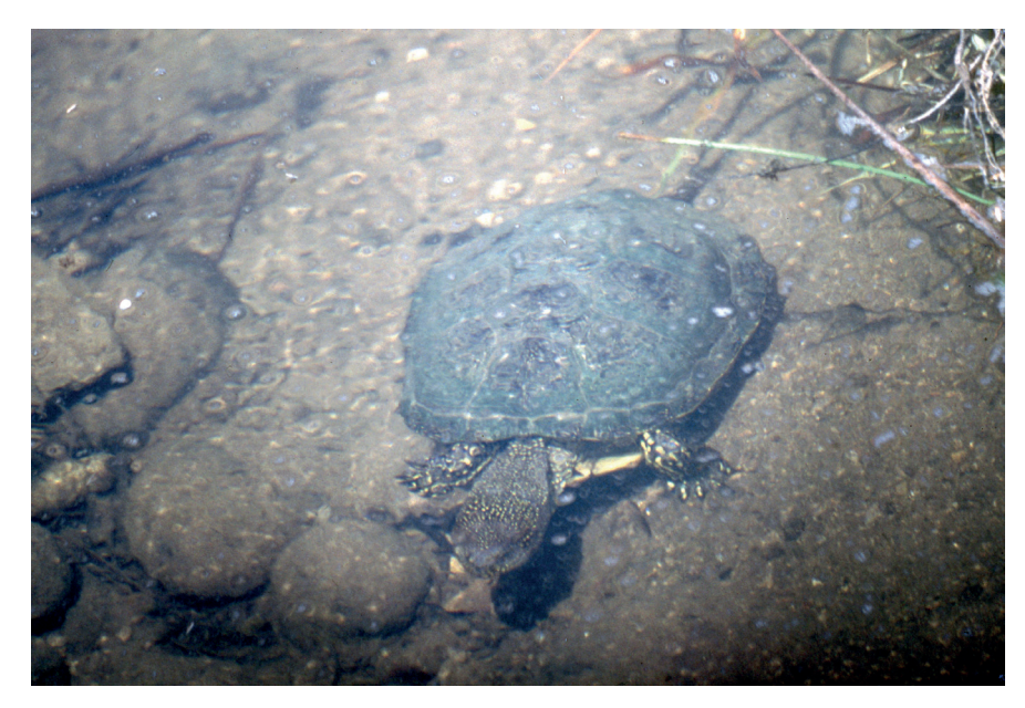
Figure 2. First record of Emys orbicularis on Gökçeada (Imbros) (May 1998) (Photo: M.F. Broggi).

coast see location map in Broggi (1999). Bayrakey et al. (2016) also confirm this evidence. As frequently observed in the Aegean, European Pond Turtles were only found sporadically among Mauremys rivulata . Suitable habitats are present on Gökçeada, although only small Emys populations can be expected, based on the observations.