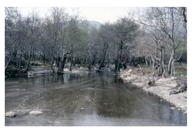
Figure 3. Estuary of the Fonias-Brook on Samothrace with first record of Emys orbicularis in May 1988.

Bringsøe (1985) writes that a Swedish tourist brought him a live European Pond Turtle on Mykonos. This was the first, and so far the only, find in the Cyclades. We know about the endangered status of Mauremys rivulata on the island (Broggi 2012; Broggi in press), and E. orbicularis has not been seen again since this single record. It is difficult to assess this 1985 find. Is it a release, is it a relict? Fritz (1992) writes about Tinos, "due to the recent finding of an Emys orbicularis on the neighbouring island (meaning Mykonos),