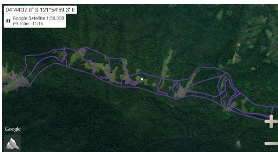
Figure 2 Area of dense forest and field in the watershed rehabilitation site

The research site is part of a protected forest in Bombana Regency. There are only two types of areas, dense forest which shown with dark green color and fields which shown with light green color in satellite imagery Figure 2 . Land cover condition after rehabilitation was shown in the monitoring document which shows the percentage of successful plantations on the site.