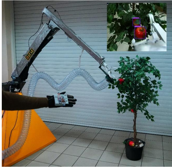
Fig. 2. Manipulator device control using the developed somatosensory controller.

According to the results of the research, it was found that the average time of harvesting one apple fruit by a manufactured manipulator in an automated mode is 12,9 seconds, the minimum time was 9,4 seconds, the maximum 15,9 seconds. Gazebo environment using a self-touch controller was 11,7 seconds. The minimum time was 8 seconds, the maximum 14,9 seconds (Fig. 3).