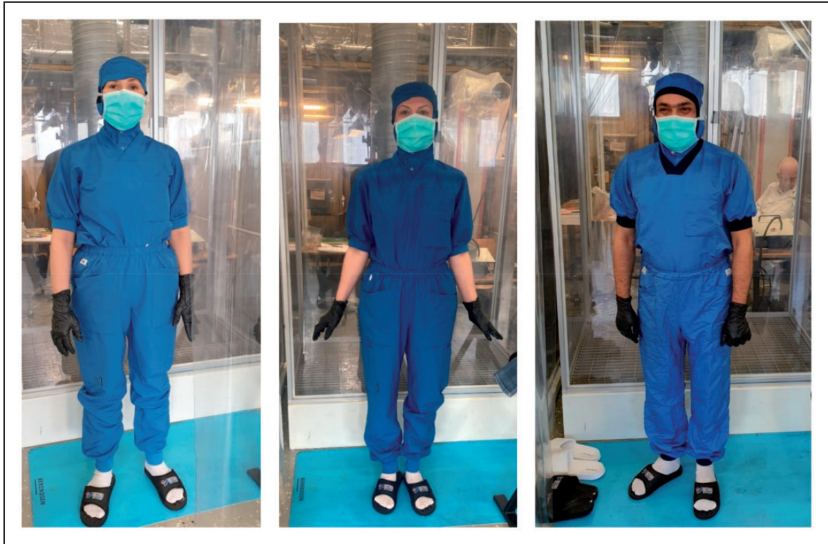
Figure 1. Clean air suits tested. From left to right: A, B and C.