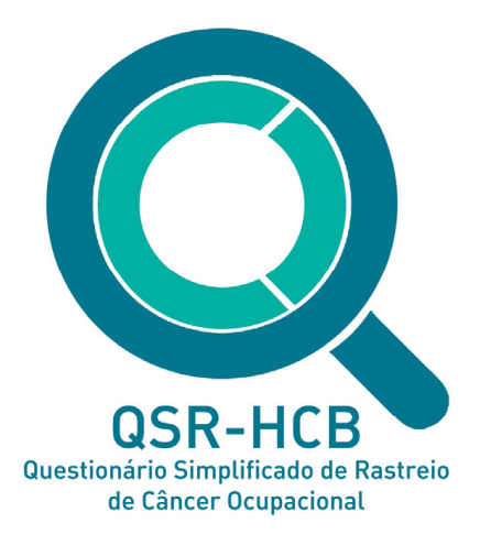
Figure 3. Homepage and registration of SSQ institutions—qsimplificado.com.br (accessed on 22 February 2023).

The results of implementing the system to collect information about work-related cancer by using a very simplified questionnaire to collect data—which will facilitate the recognition of potential carcinogens in workplace environments—were demonstrated to be a very promising tool that will be shared with different areas throughout the Brazilian territory.