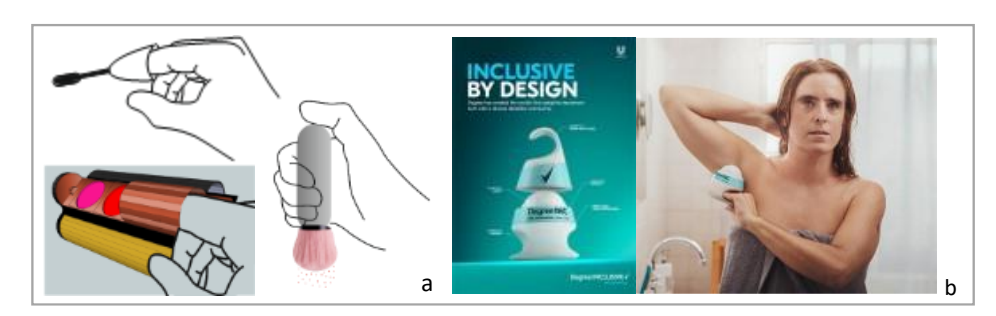
Figure 2 (a) Makeup Kit (L Bacelar) and (b)Degree, packaging design (www.theroereport.com)

The Makeup Kit<sup>3</sup> emerged from a comprehensive academic project that encompassed the typical phases of a design endeavor (Figure 2 a). As an Inclusive Design work, it commenced with awareness-raising activities that involved simulations and firsthand testimonies. In this particular case, the student, observed the challenges faced by older women when applying makeup, particularly concerning the intricate details and reduced dimensions of the makeup components. Instead of individual and separate items, the student devised a compact Kit that consolidates various makeup elements within a roller. It can be held with one hand while utilizing a finger-dressed mascara brush or applying eyeshadow with another finger. This solution was deemed a good problem due to the significant role makeup plays in boosting the self-esteem of older women, irrespective of their abilities - an observation emphasized by the author in her initial research involving real users. The proposed solution encompasses multiple features that facilitate its use by individuals with limited motor skills, enabling them to accomplish intricate tasks with ease, even if they have reduced dexterity in their hands and/or fingers.