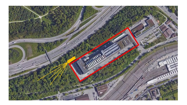
Figure 4: The "Geospeicher Forsthaus" is being built on the site of the Forsthaus energy center.

The drilling of three 200 - 500 m deep boreholes in fluvial sediments of the Lower Freshwater Molasse was started in October 2022. Five wells (cold legs) will be drilled around one well in the center serving as injection well (hot leg). The boreholes are to be equipped with fiber optic cables to record temperature, acoustic and strain data. The monitoring with fiber optic sensors will be tested and validated to ensure the operation of the HTS and optimize its performance.