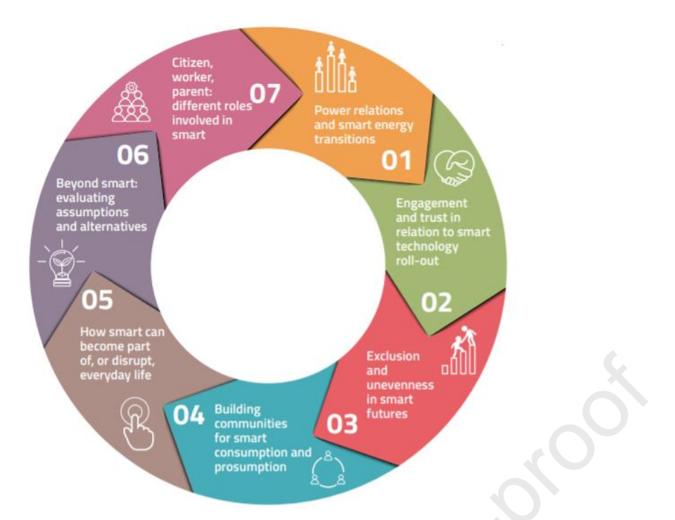
Figure 2. The seven Themes of the Energy-SHIFTS Smart Consumption research agenda.

To emphasise the need to better integrate SSH concepts in interdisciplinary discussions about smart energy futures, we have indicated several key SSH concepts in italics alongside brief definitions and example references<sup>6</sup>. All questions were concerned with low-carbon transitions of the socio-technical systems around energy. Inspired by Rotmans et al (2001), the WG defined transitions as transformation processes in which society changes in a fundamental way over a generation. The WG was committed to the view of innovation and transformation of energy systems as concerning socio-technical systems , in which social and technical elements are interrelated and cannot be understood as separate entities (Köhler et al., 2019; Geels, 2018).