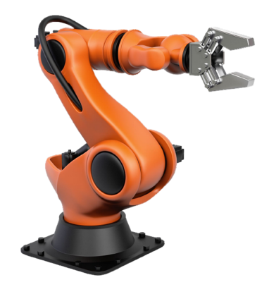
Fig. 2. Symbolic Picture of Robotic Arm